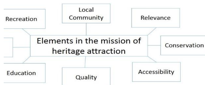
Figure 1.1: Elements in the mission of heritage attraction

The concept that is used in this study is the Elements in the mission of heritage attractions: Conservation, Accessibility, Education, Relevance, Recreation, Local Community, and Quality. (Garrod and Fyall,2009). The researchers used this concept to identify the objectives of the study. This study is unique because our focus is not just in the church but also the museum inside the church.